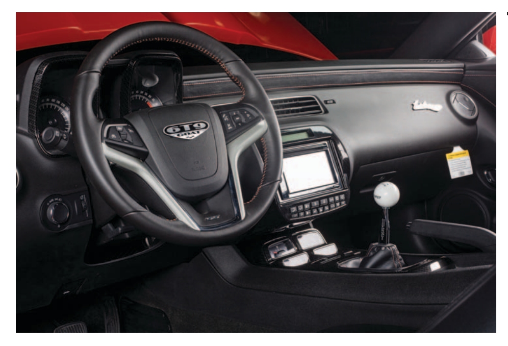
▲ Inside, it's all about comfort and functionality. The custom leatherwork, orange stitching, and modern touches make this an inviting cabin, although you certainly still get the old school vibe...