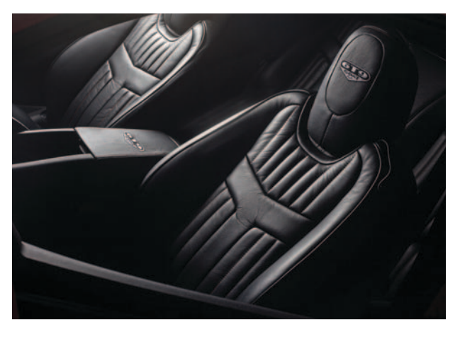
▲ ...Especially when you take a look at the seats. Designed after the '69 buckets, the Trans Am Depot seats look like those that you would find in a factory-built GTO, although they still offer all of the safety and functionality you would expect in a new car.